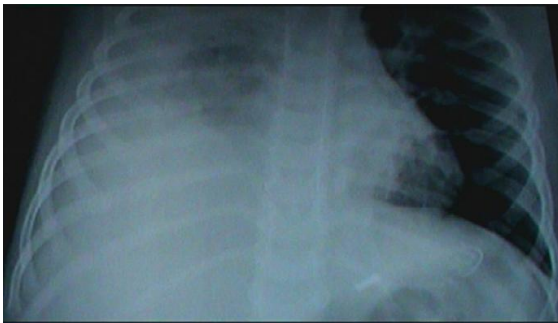
X-ray: right lung completely collapsed, they wanted to cut it out.

Everything is a defense mechanism: in §74 Hahnemann says how the body first tries to defend itself with spasm, sensitivity, etc. (Psora), then by contraction, dilatation, relaxation or induration (Sycosis). Finally the body will destroy either the function or the organ itself to save the whole (Syphilis).